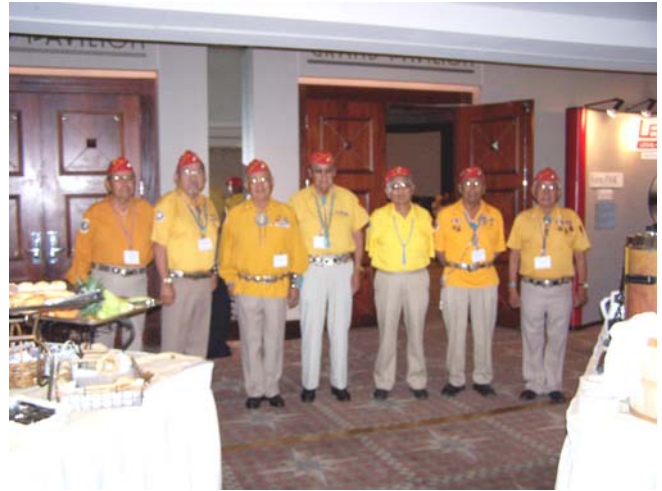
Navajo Nation Code Talkers