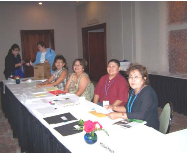
Registration Table: Navajo Nation Dept of Child Support staff.

Each year the conference grows in numbers of attendance, and this year was no exception. Over 200 people attended the training conference held at the Hyatt Regency in downtown Albuquerque. Numerous tribes were represented along with staff from state and federal programs.